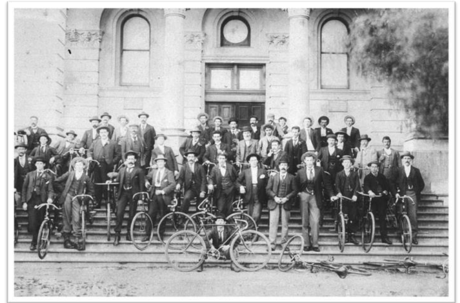
Dubbo Bicycle Club on the steps of the Court House 1901 - Dubbo, NSW